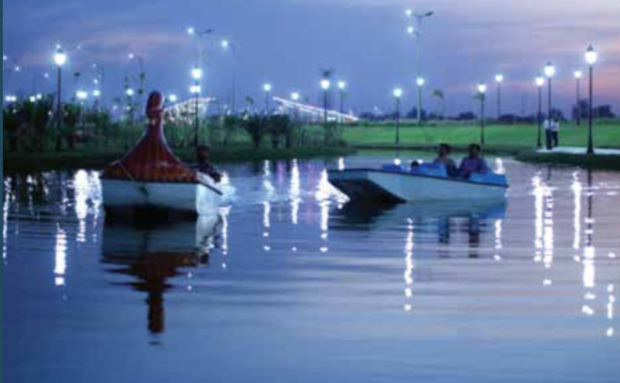
EVENING COMES ALIVE AT YAMUNA LAKE