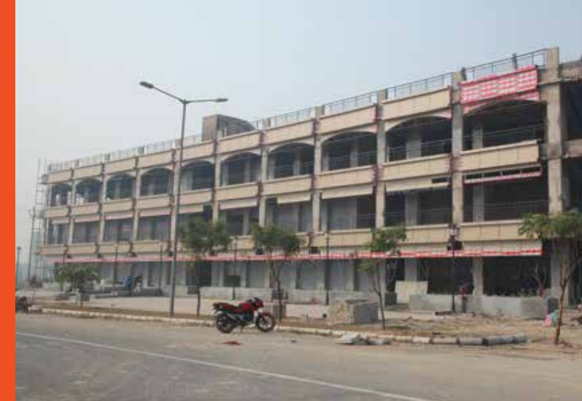
GYC GALLERIA (SHOPPING COMPLEX)

Gaur Yamuna City is one of the biggest amalgamations of residential, commercial and retail outlets making it the talk of the town. With the basic civic infrastructure of the highest standards, it also possesses state-of-the-art amusement and recreational activities. The entire township is thoughtfully planned to give an exemplary experience. It offers Retail Shops, Apartments, Studio Apartments, Themed Villas, Plots, Sports and a lot more.